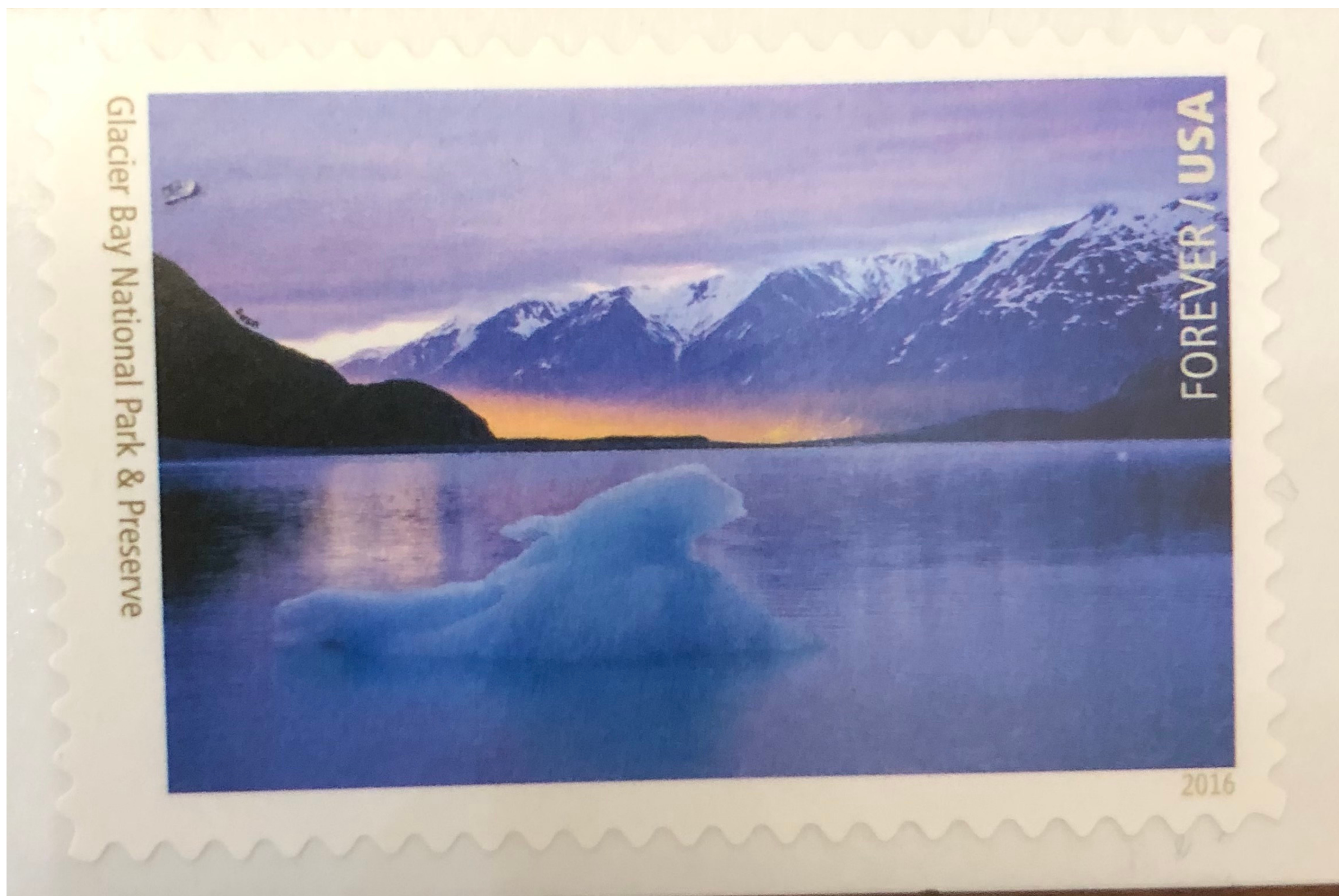
Glacier Bay National Park & Preserve Forever Stamp, 2016.

This is a stamp of Glacier Bay National Park and Preserve which was established as a national park in 1980 by the NPS. The melting glacier in the stamp sends a very powerful message in that if the government and the public fail to slow down climate change, the beauty and ecological growth we receive from these national parks will not last. Even though the work of the NPS has helped in preserving the environment, ecological systems, including the ones in these parks, are under threat all around the world, which means we must act with urgency.