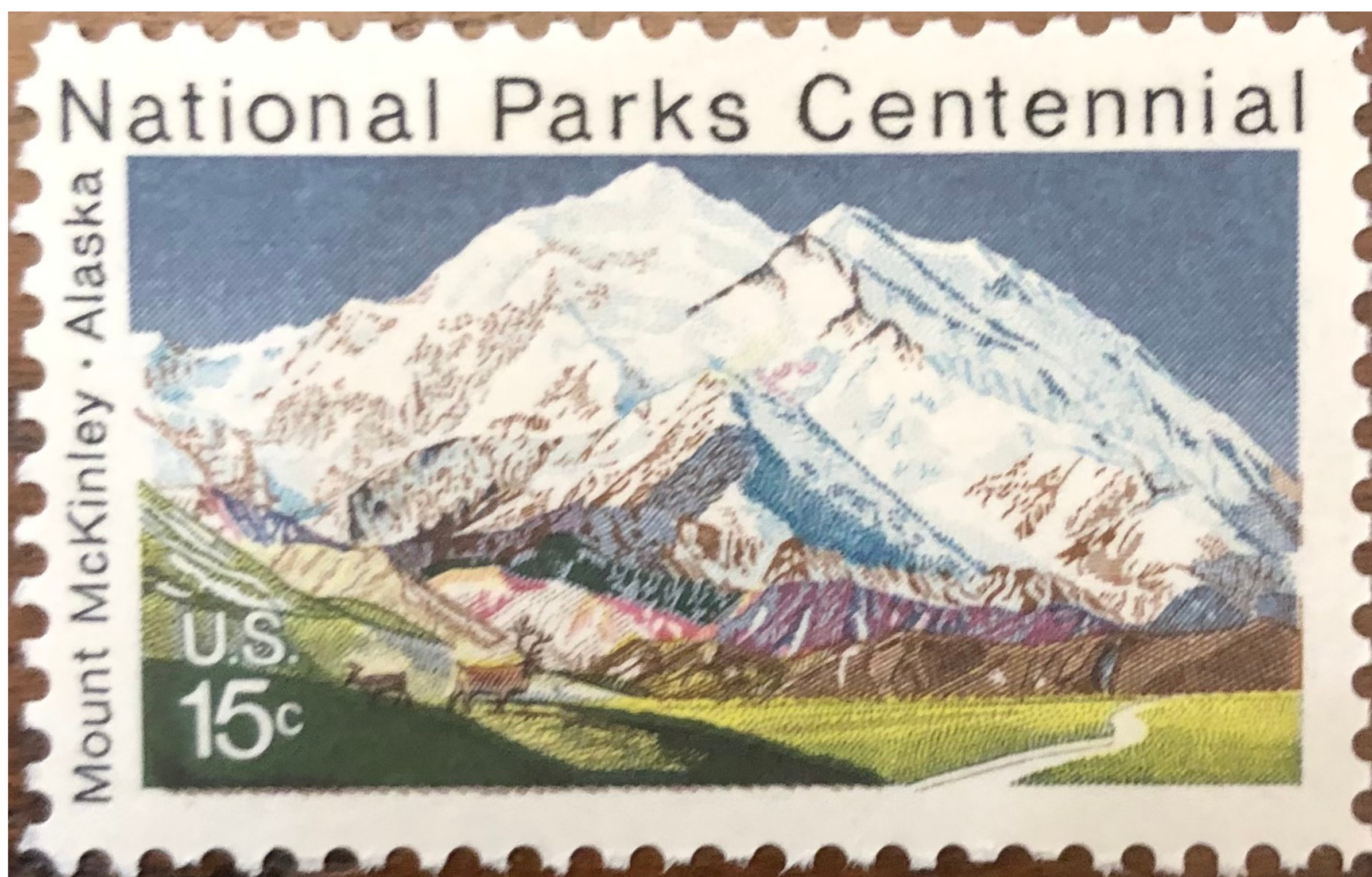
Mount McKinley Alaska 15c stamp, 1917

This is a stamp of Mount McKinley in Alaska which was established as a national park by the NPS in 1917 during Wilson's presidency. The reason that Mount McKinley was established as a national park was that at the time there were many rumors of gold in the Mount McKinley area, so mining companies were attempting to gain rights over the land so that they could extract resources from the mountain.