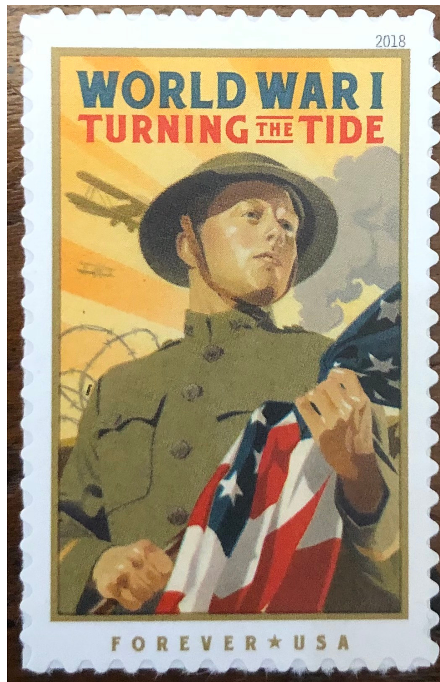
Turning of the Tide World War I Forever 50c stamp, 2018

This Turning of the Tide stamp was issued in 2018 to honor the millions of American soldiers and families who experienced World War I on the frontlines at home and abroad. It shows a patriotic image of a determined young soldier holding an American flag amid chaos. Many historians and American citizens still debate today whether the U.S. entering World War I was necessary. However, it seems the public no longer resents Wilson for entering the war as this is one of the few stamps that actually celebrates American involvement in the war.