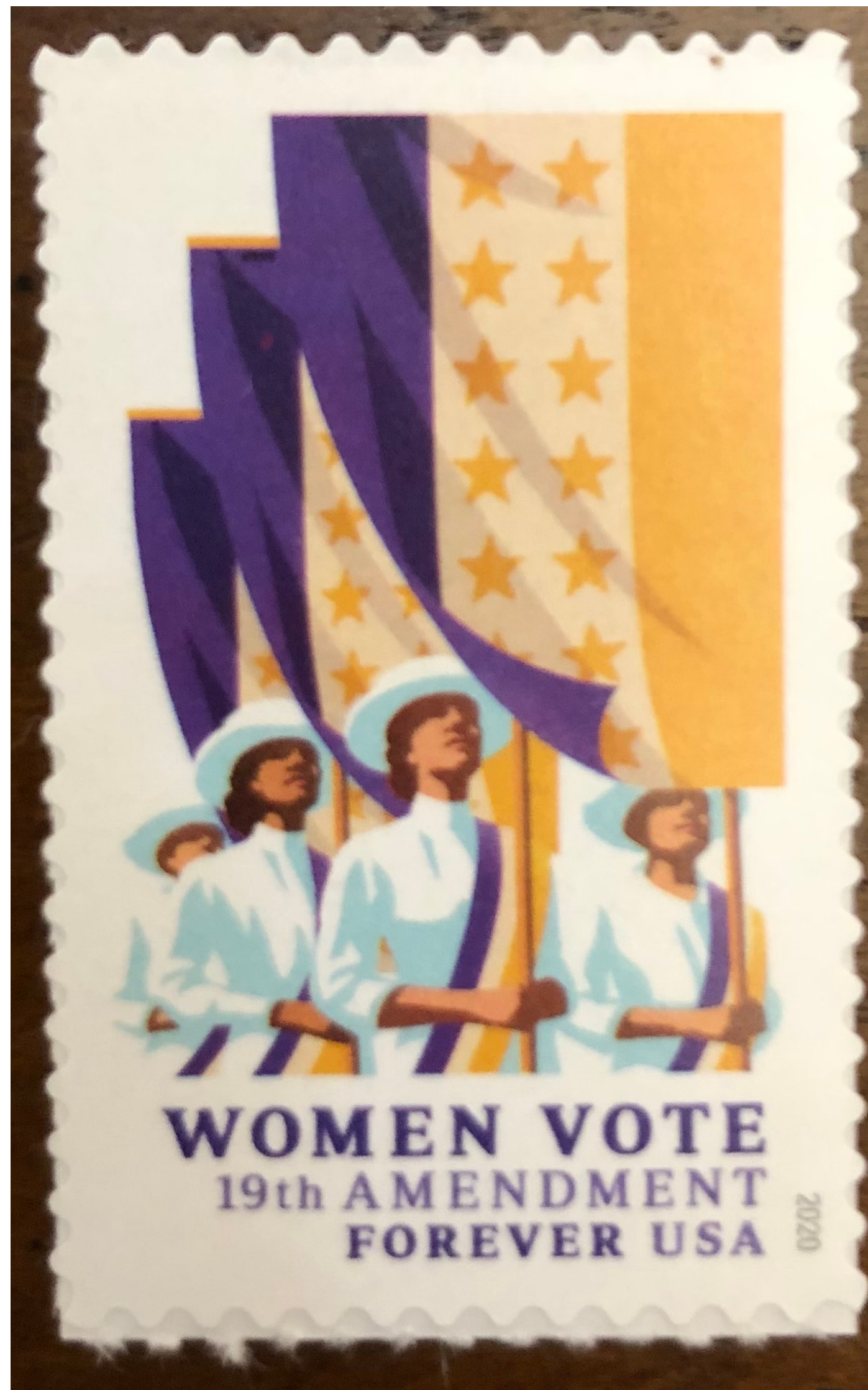
19th Amendment, Women Vote Forever Stamp, 2020.

This stamp celebrates the 100th anniversary of the suffrage movement.