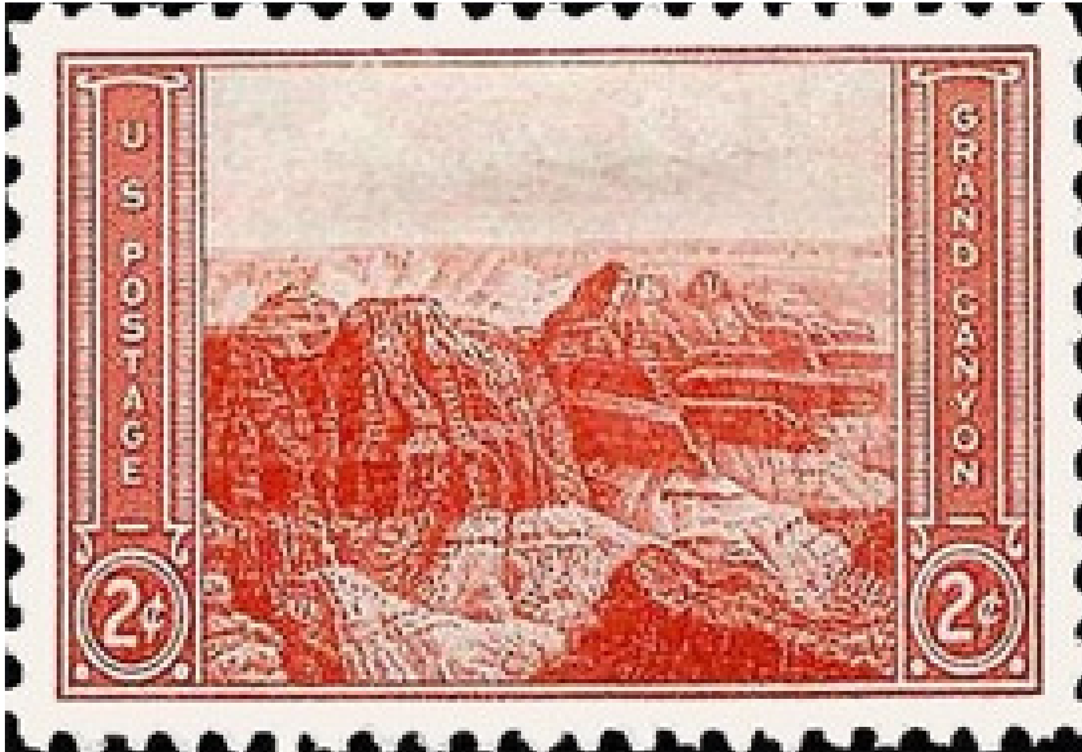
Grand Canyon 2c red stamp, 1934.

The National Park Service (NPS) which was founded during Wilson's presidency, established the Grand Canyon as a national park in 1919. This stamp commemorated one of the first 20 national parks recognized at the time. This series was issued because in 1934 FDR was attempting to expand the NPS, and wanted to show the American public the diversity and beauty of these national parks. Today, there are 62 national parks in the United States, so the work of the NPS has left a tremendous impact on the U.S. long after Wilson died