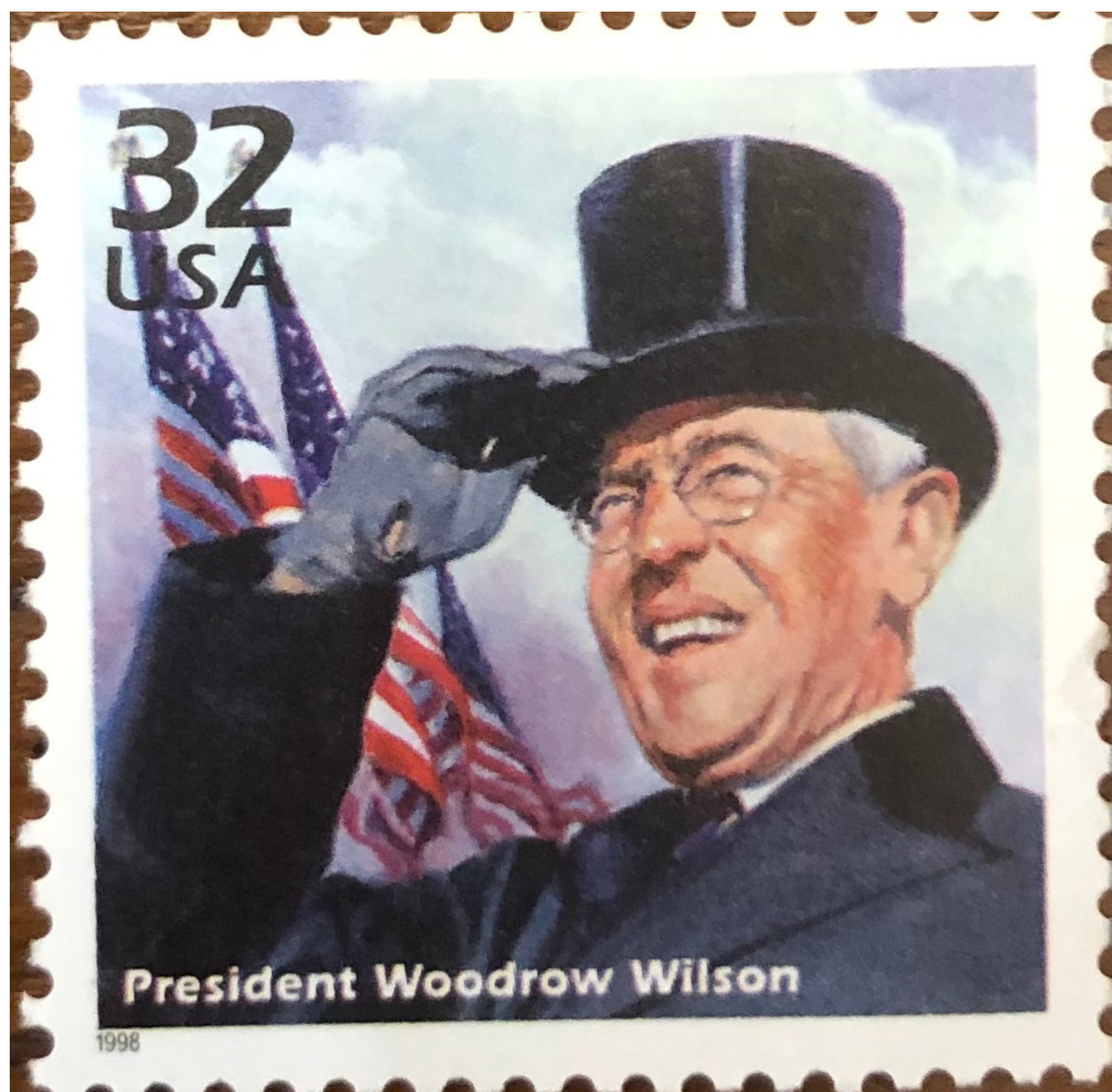
President Woodrow Wilson 32c stamp, 1998