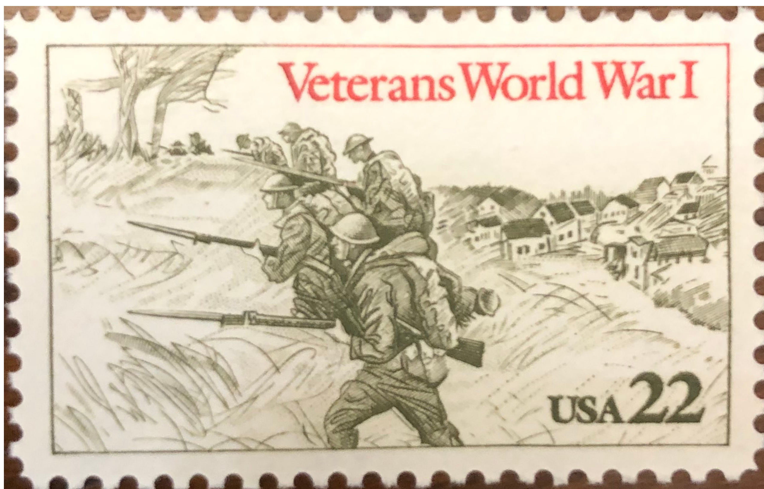
Veterans World War I 22c stamp, 1985.

Between 1919 and 1985, no stamps were released about World War I. The reason that this stamp was released is likely due to the large social movement developing in 1985 which focused on advocacy for veterans. During that year, the Veterans for Peace organization was founded and there were large protests in cities like DC and New York City fighting for veteran rights. So, while this a World War I commemorative, it has more to do with supporting the veterans of the war than celebrating the war itself.