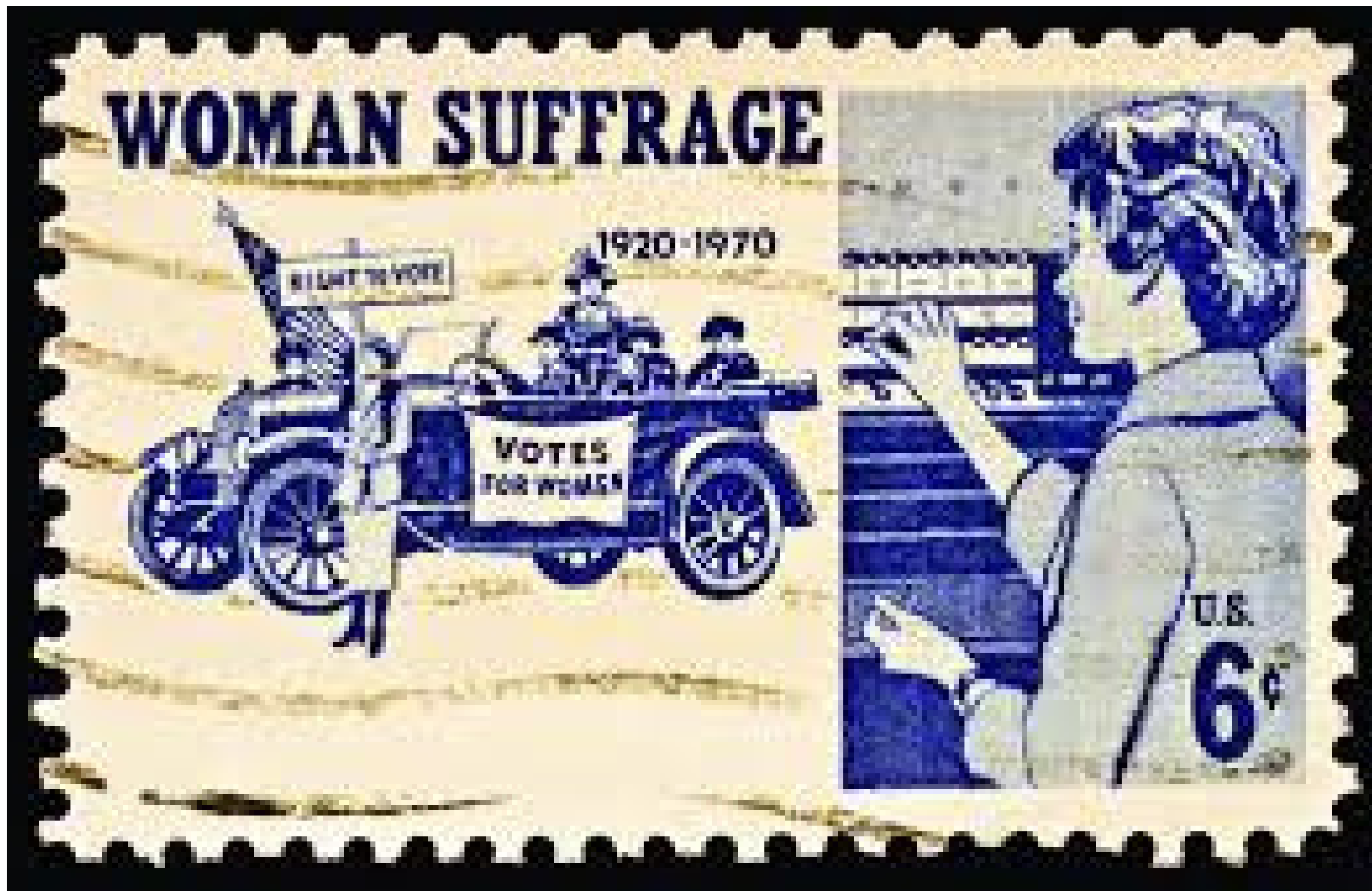
50th anniversary women's suffrage 6c stamp, 1970

This stamp celebrates the 50th anniversary of the 19th amendment. On the left are suffragists protesting for women's rights, and the right is a woman voting on a machine. Despite the advancements in stamp technology seen during this time, there is a lack of color variation, and the design of the suffragists protesting is small and distant. The stamp communicates that in 1970, the suffrage movement was only about voting and not about women's rights as a whole. This makes sense as gender inequality was still rampant in 1970. There was a Women's Strike for Equality in New York City of 50,000 protestors demanding gender equality in the workplace as well as more access to abortions and childcare. There was also an ongoing problem of domestic abuse, which was not fully addressed until the Violence Against Women Act of 1994.