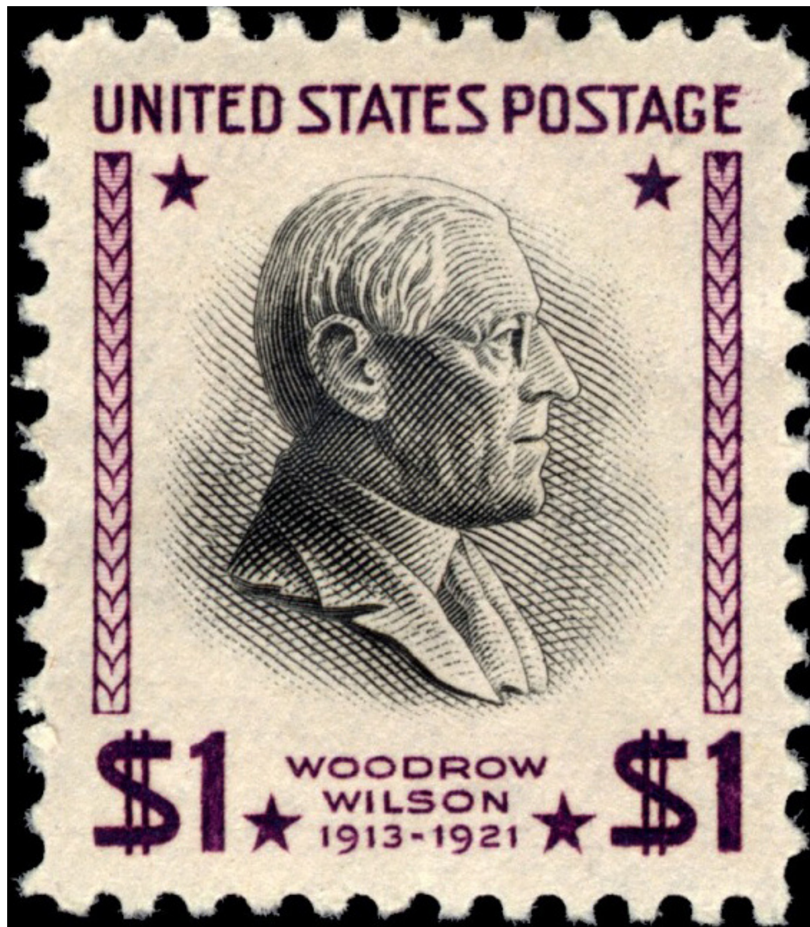
Wilson $1 stamp, 1938.

This stamp celebrates Wilson winning the Nobel Peace Prize in 1919 for drafting the League of Nations. The design of Wilson is printed in black ink, has a side profile, and has a stoic facial expression. It hardly seems like a celebration of Wilson at all, even though he was the first president to win a Nobel Peace Prize. This may be because many Americans, particularly isolationists, opposed the League of Nations. Since the U.S. refused to ratify the Treaty of Versailles, the U.S. was never a member of the League of Nations, so this is the only U.S. stamp that celebrates the League of Nations.