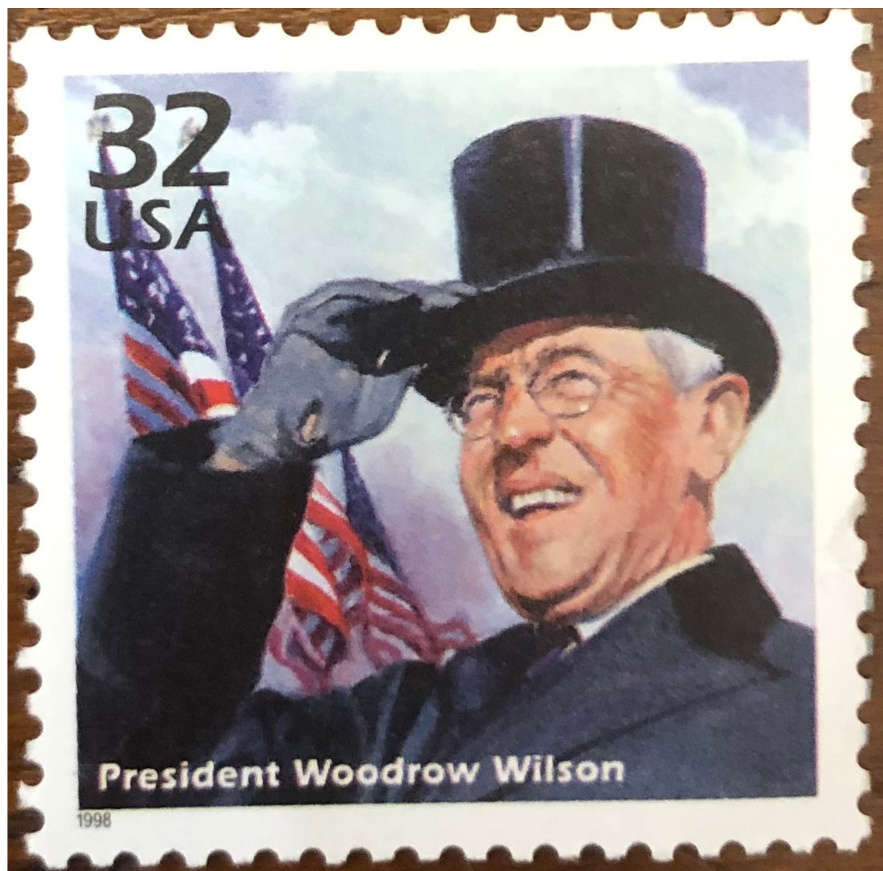
President Woodrow Wilson 32c stamp, 1998

This stamp is part of the Celebrate the Century collection which commemorates major events and leaders of the 20th century. The stamp depicts Wilson looking into the sun which symbolizes how he was a progressive since he's looking into the future. The American flags in the background celebrate Wilson's views spreading American democracy. These views are emphasized most in the 1998 stamp since it is the end of the Cold War and the U.S. is the most dominant global power in the world. While the 1938 Wilson stamp indicated that the American public and government disliked Wilson's international vision, by 1998, that vision was celebrated.