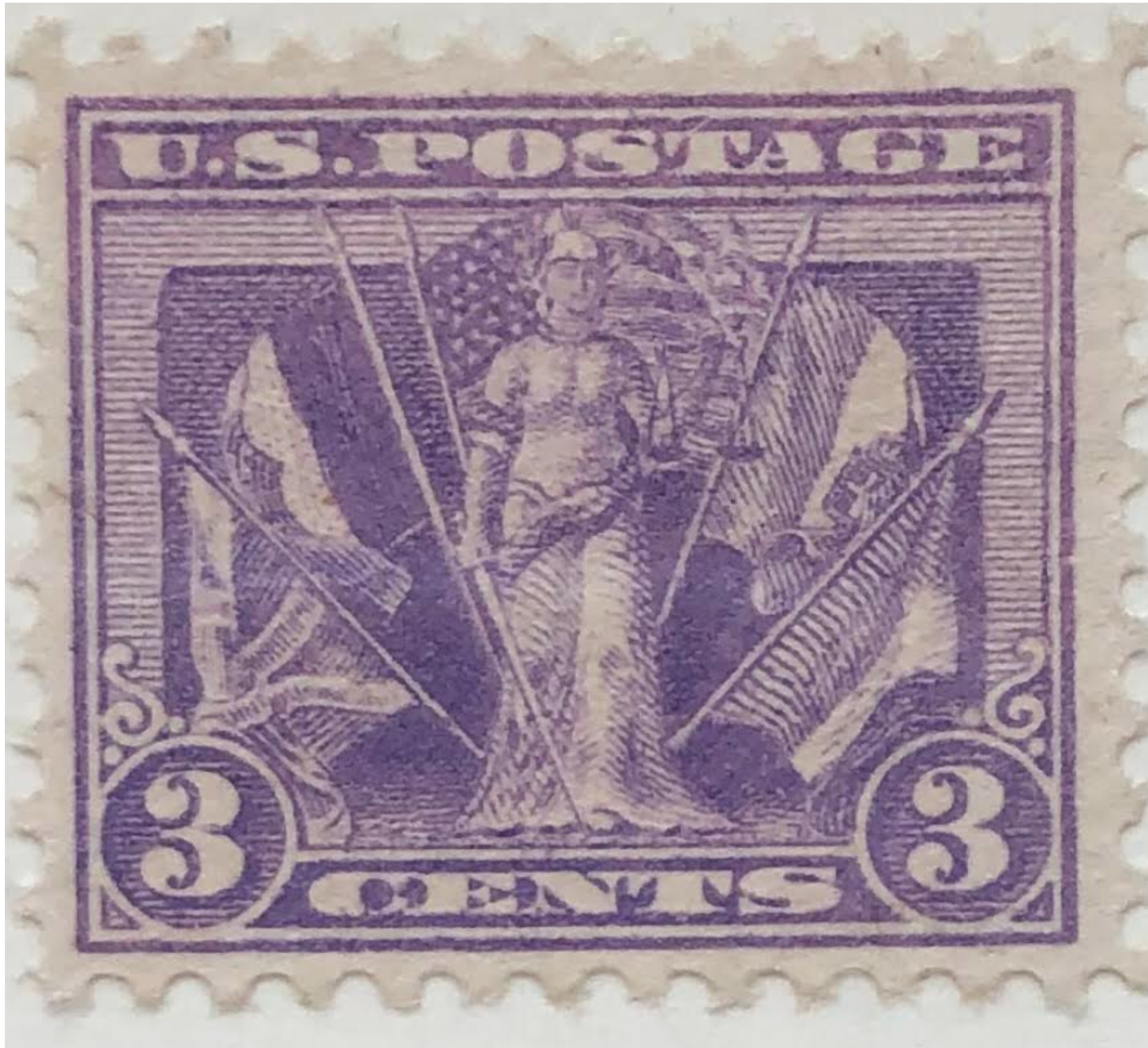
Liberty Stamp 3c violent, 1919. From the Woodrow Wilson Hosue collection.

This is the very first copy World War I Victory stamp and the first stamp in American history to commemorate World War I. The design shows the Goddess of Liberty Victorious standing in front of the flags of the Allies. Isolationists, or Americans who followed President Washington's philosophy in staying out of foreign affairs, scrutinized Wilson for entering World War I. For this reason, the Liberty Stamp was the only World War I stamp issued by the Wilson administration during and after the war. In comparison, Franklin D. Roosevelt issued far more stamps during World War II.