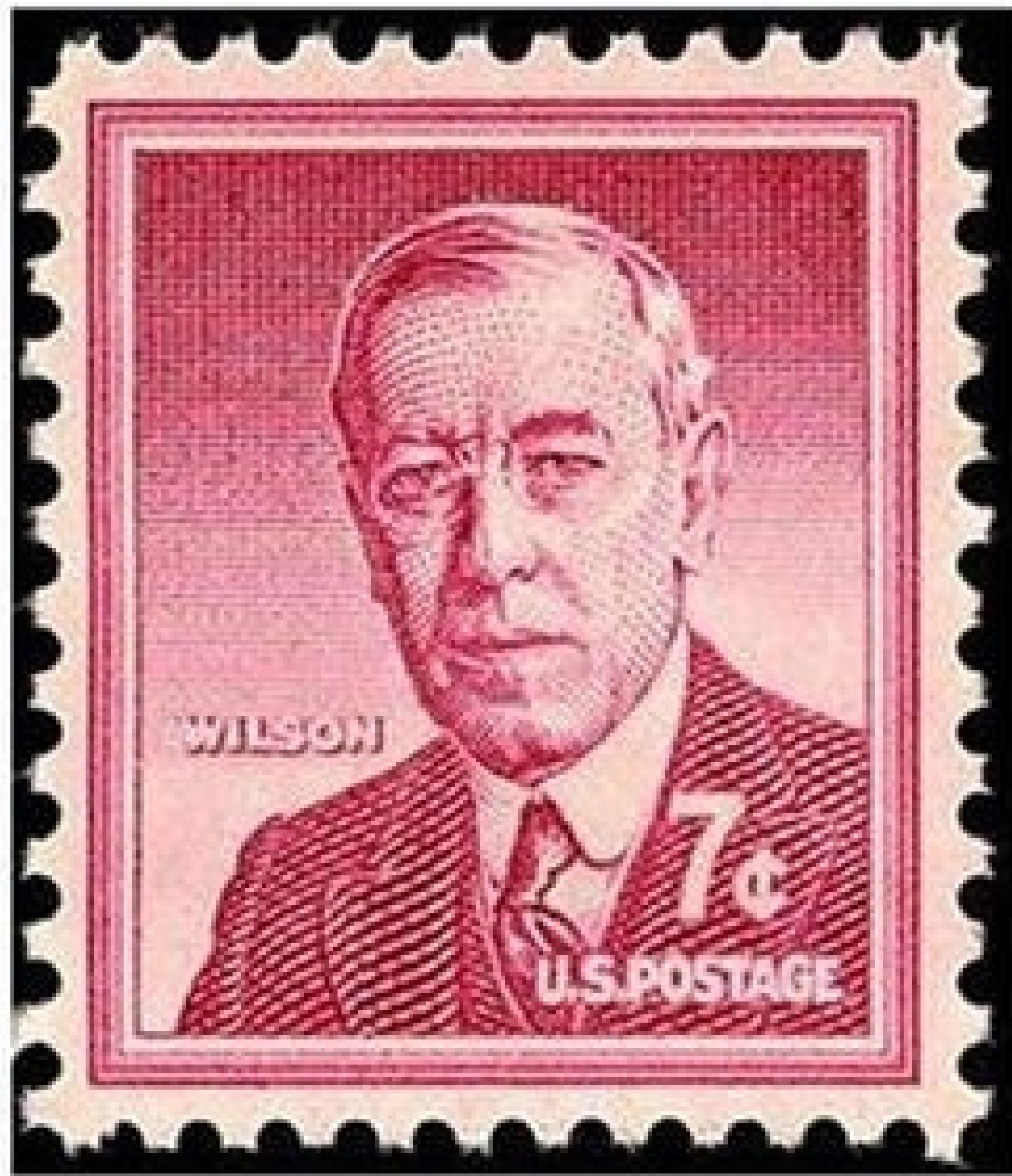
Liberty Series Wilson 7c red stamp, 1956

This is a stamp of Wilson that was part of a Liberty Series issued to celebrate defenders of freedom throughout U.S. history. Wilson was included in this series for his views on spreading democracy throughout the world. This makes sense because the government at this time was in the middle of the Cold War, so they shared Wilson's vision of a world of only democracies. As a segregationist, Wilson is far from a defender of freedom by today's standards, but this government who still enforced Jim Crow ignored that part of his legacy when they issued him as a part of this series.