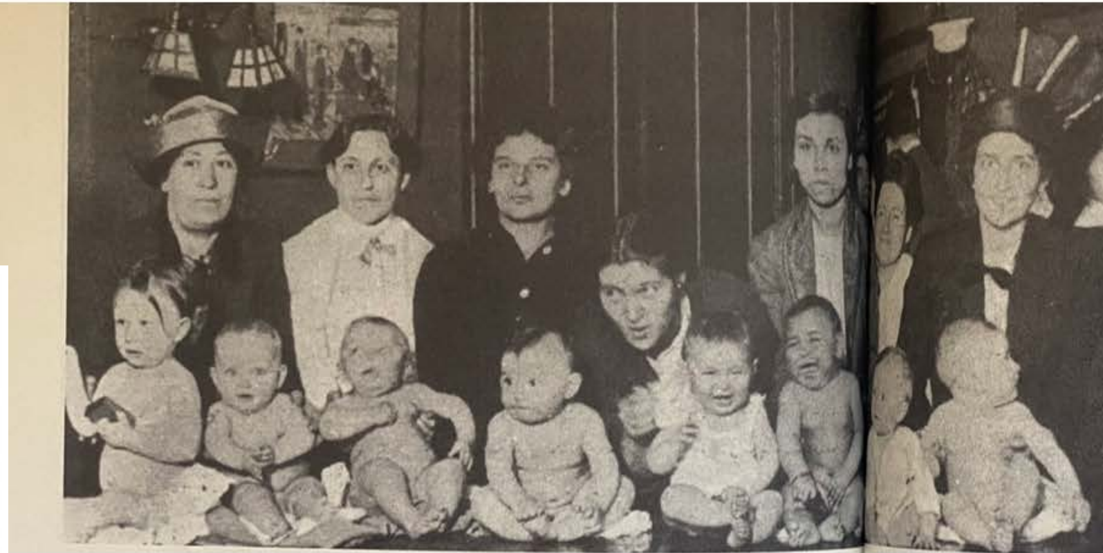
6. Some of the babies who scored high in a better baby contest sponsored Settlement in New York City.